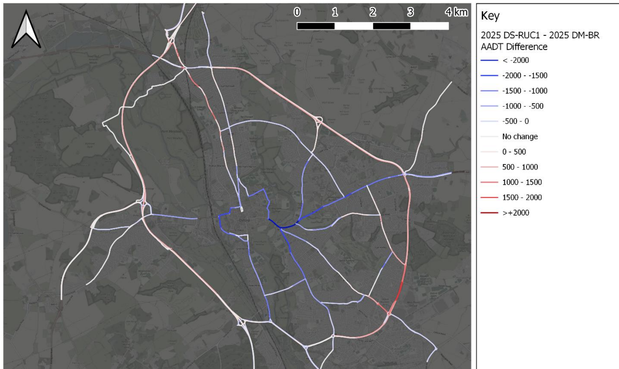
Figure 3-2 - change in AADT (as %) between DS-RUC1 and DM-BR along modelled road links in Oxford. Blue = net decrease in AADT, white = no net change, red = net increase in AADT